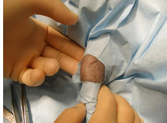
Figure B – prep for surgery