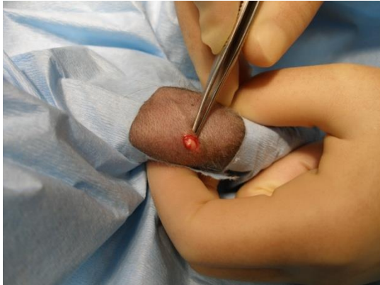
Figure C – make incision for implant removal