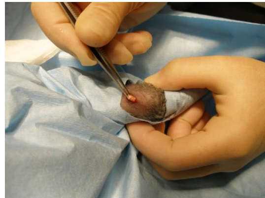
Figure D – Remove ALL pieces of implant