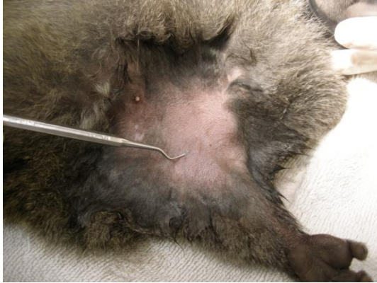
Figure A – shave and wipe area with alcohol swab